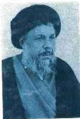
آیت‌الله محمد باقر صدر

The Ayatullah enjoyed great respect in the Muslim world right from Morocco to Indonesia and was one of the greatest champions of Islamic form of government. The Iraqi government was in funk on this account. It therefore, interned him in Najaf in the middle of 1979 and transferred him to Baghdad Jail on April 3, 1980 where he was martyred on the night of April 9, 1980. May Allah bless the sacred soul of the Ayatullah.